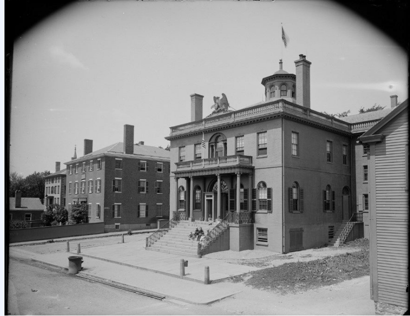
The Custom House and Brookhouse pictured around the 1890s. This photograph is courtesy of the Salem Maritime National Historic Site. It is believed that Nathaniel Hawthorne wrote his best selling novel, The Scarlet Letter , inside the Custom House in 1849.